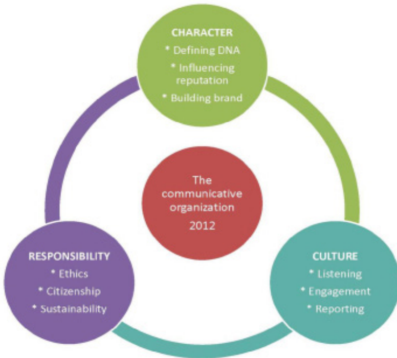
Figure 1: The three dimensions of communication as per the Melbourne Mandate (Global Alliance for Public Relations and Communication Management, 2012).